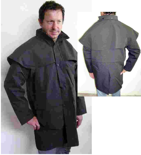
KIMBERLEY JACKET $79.95

INSIDE LEG: Should be taken from the bottom of the leg up the inside seam to the crotch.