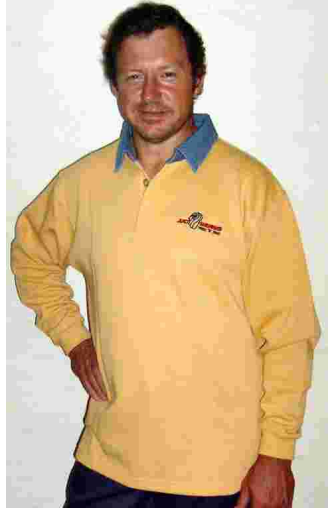
'JUST SHEARING' RUGBY SHIRT $49.00

'JUST SHEARING' COLOURED POLO SHIRTS child $25.00 adult $27.50